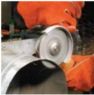
Thin gauge cutting