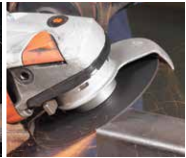
Cutting and deburring